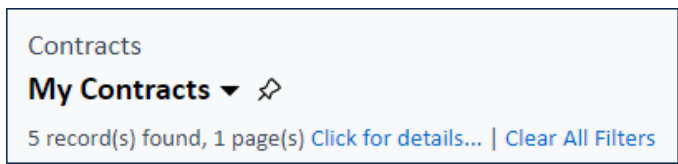
My Contracts saved search

The top of the table view shows the table name, the name of the saved search, and the number of records. You can click the "Click for details" link to see the current search criteria, or click the pin icon to mark the saved search and optionally open it automatically when you open the table.